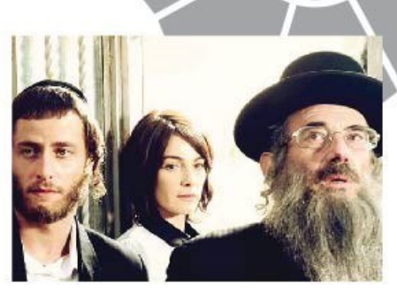
SHTISEL MANIA SCREENING AND Q/A WITH DIRECTOR February 5