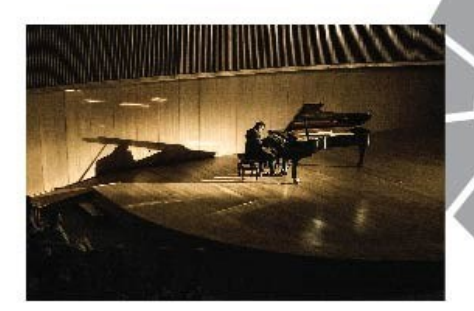
GOD OF THE PIANO SCREENING AND Q/A WITH FILM DIRECTOR February 12