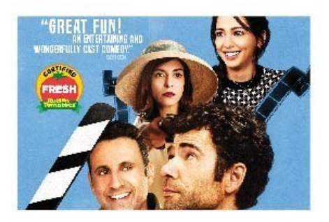
TEL AVIV ON FIRE SCREENING AND Q/A WITH FILM DIRECTOR January 29