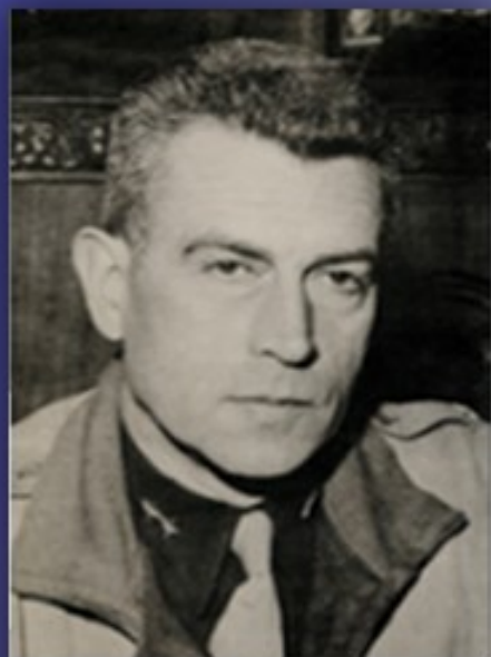
Major General Maurice Rose Post 51

LEADERSHIP AT THE EDGE: EMERGENCY EXTRACT OF A MARINE RECON TEAM