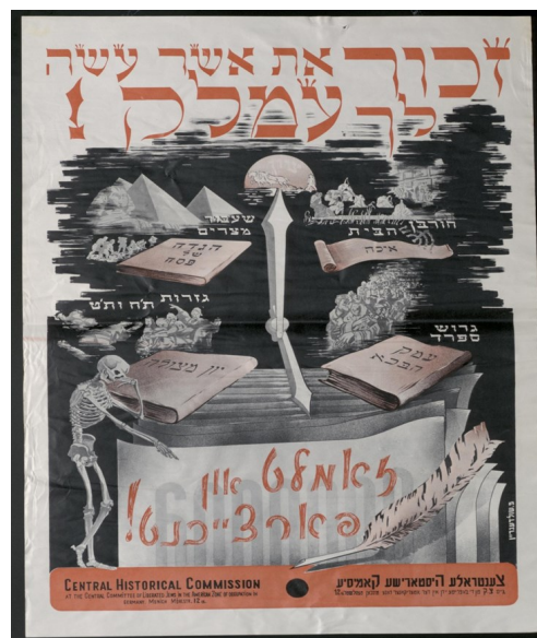
Poster "Remember What Amelek Did to Thee! Collect and Record!", 1947